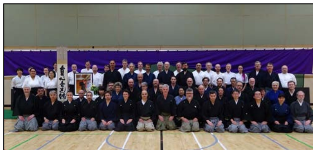
Tsuito Shakai, February 2016