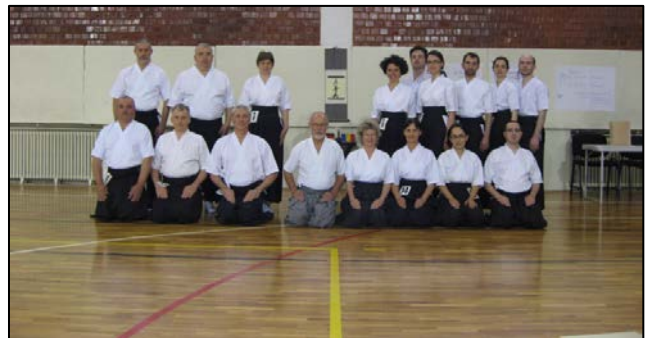
National seminar, Bucharest, Romania, April 2013