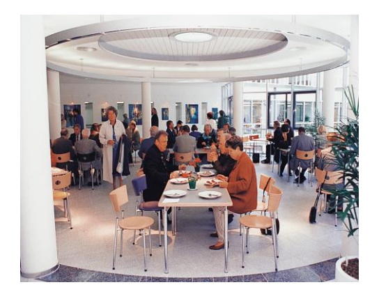
Rooms: They are inside the sports school

The sports school provides the taikai location and the accommodation facilities as well. It's easy to be reached by S-Bahn (S-rail) and car from central station or the airport as well.